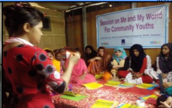
Orient headmasters and SMC about the importance of CSE/NCTB-SRHR education in schools