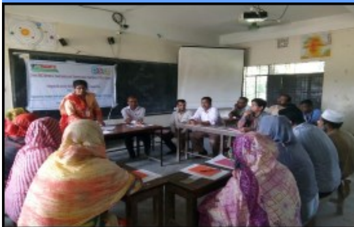
Increasing knowledge and skills of SRHR through Youth Organizers