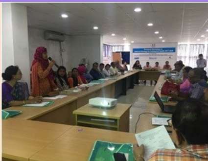
Divisional Workshop of NEARS at Local Level

As part of contributing the implementation of National Strategy for Adolescent Health 2017-2030, the second divisional workshop was held at Rangpur on 28th May 2019 where total participants were 56. The participants were from NEARS member organizations including Executive Director, Team Leader, Program Officer, Coordinator, convener and representatives. Besides, GoB officials from Family Planning and Health Departments, journalists, youth leaders and other NGO staff were present.