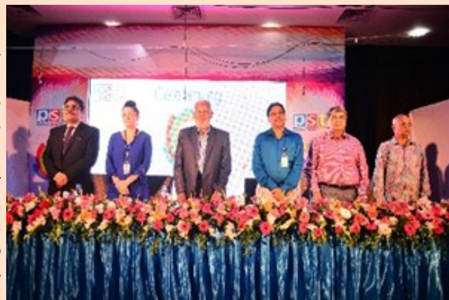
Honorable guests at the occasion